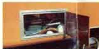
Handy storage compartment lets you load camping gear from outside the trailer.