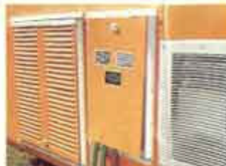
City-water hookup, drains and 115-V power cord are conveniently located under a single access panel with locking security feature.