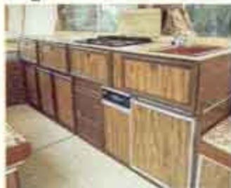
Spacious galley cabinets are 35" high, so you don't have to stoop when you cook. There's plenty of counter space on top, loads of storage room inside.