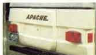
Locking Continental-style spare tire compartment keeps optional spare tire safe, clean and easy to reach.