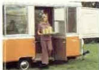
Doorway is a full 28" wide, so you can walk through instead of squeezing through.