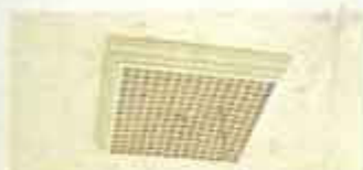
12-V, 2-speed power ventilator in ceiling keeps the air fresh and clean.